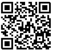
SCAN HERE TO GIVE

Give online on our website at https://stjohnsumctc.org/giving/ Text "GIVE" to (409) 226-0450 or Scan the QR CODE and then follow prompts. Thank you for your generosity and blessing!